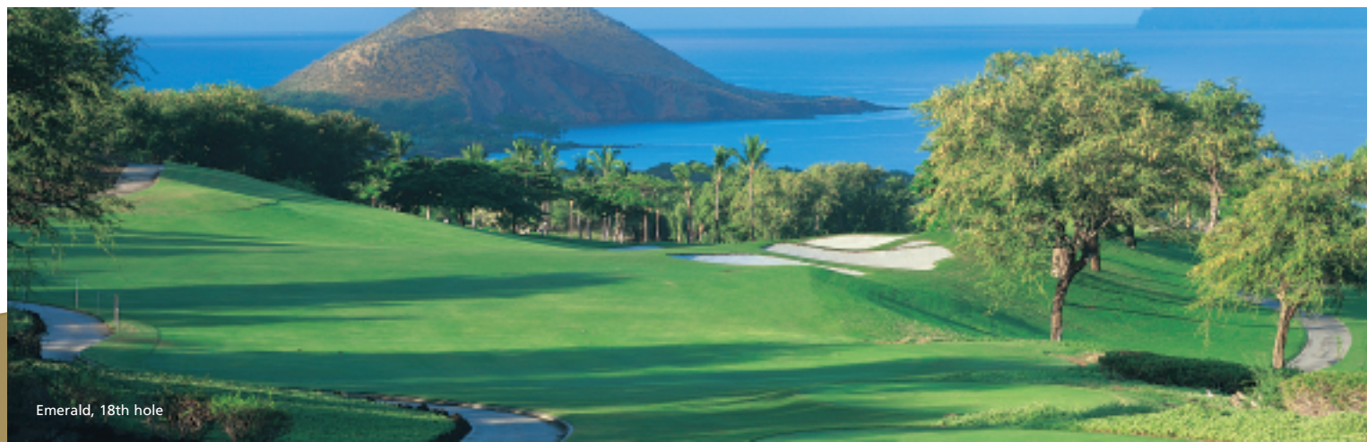
Emerald, 18th hole

For Hawaii's best golf experience, call us at 1-888-328-MAUI or visit www.golfbc.com or www.waileagolf.com