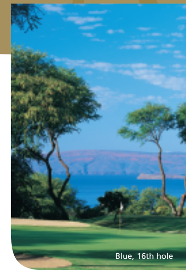
Blue, 16th hole

The Wailea Blue is marked by open fairways and challenging greens. Formerly the site of two televised professional golf tournaments, the par-72 Blue is skillfully designed to be enjoyed by a broad range of players. The course meanders through much of Wailea, weaving up and down gentle slopes carpeted by tropical flora, and affords impressive vistas of the sapphire Pacific Ocean, magnificent volcanic slopes and Maui's offshore islands.